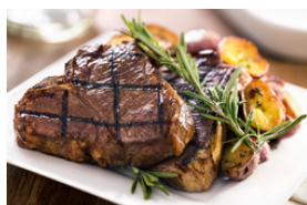
Lamb in a light sauce